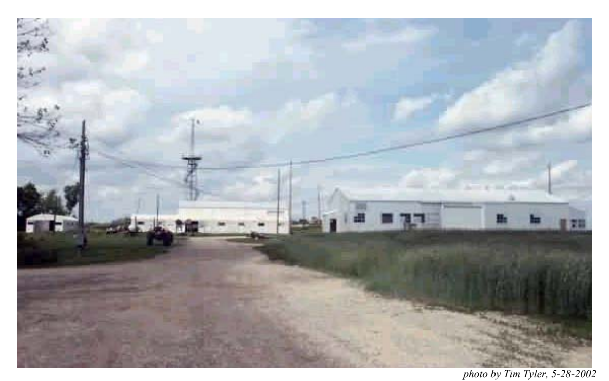
Figure 2. Manned and Unmanned Gap Fillers Side by Side at Dallas Center, IA

In this second example, the unmanned gap-filler radar equipment was housed in the old Radar Operations building used for the original manned gap-filler facility.