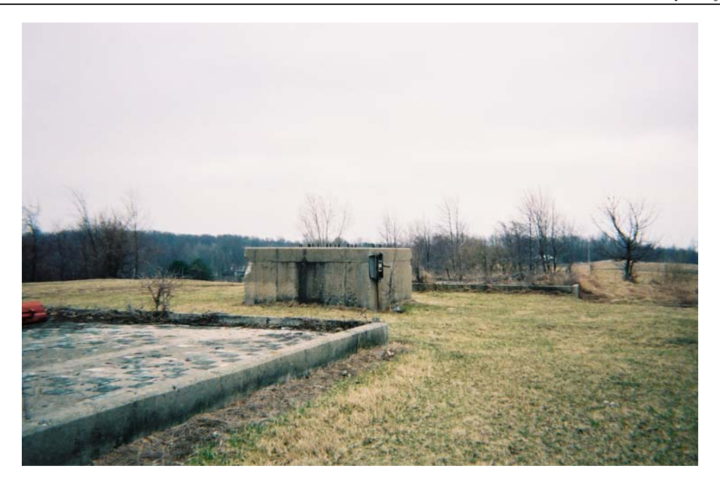
Looking Northeast at old Foundations, From Left to Right is Operations Building, Radar Base and Maintenance/Generator Building