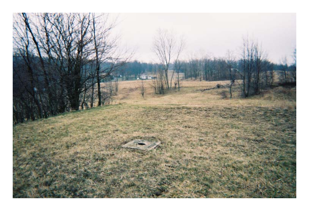
Second view of possible well head, looking east