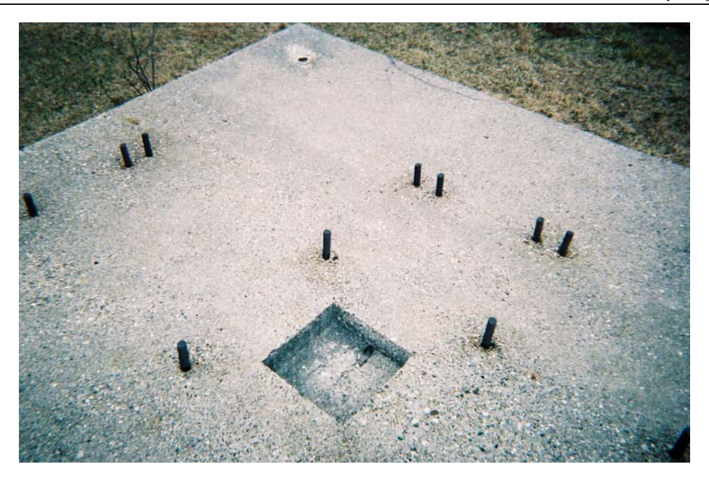
Top of Radar Base with Mounting Bolts