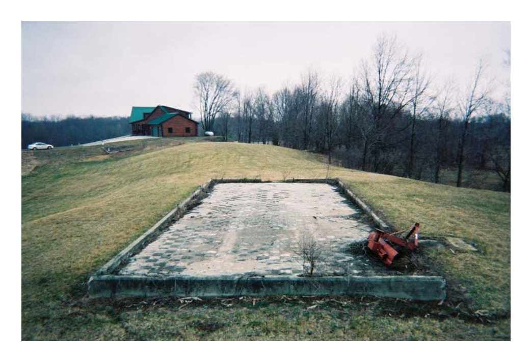
Operations Building Foundation, Looking West Current Property Owner's Home in Background