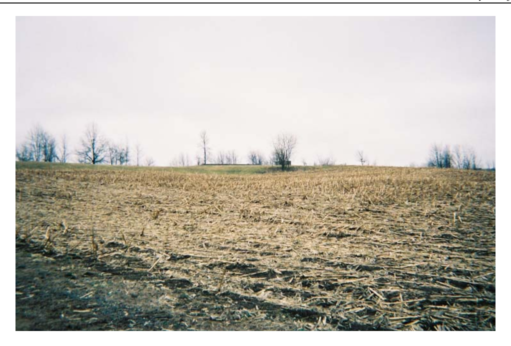
Looking Northwest at Radar Site Base for the Radar is behind tree