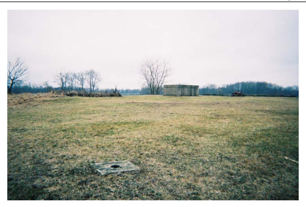
Looking Southwest at Building Foundations Possible water well head in foreground