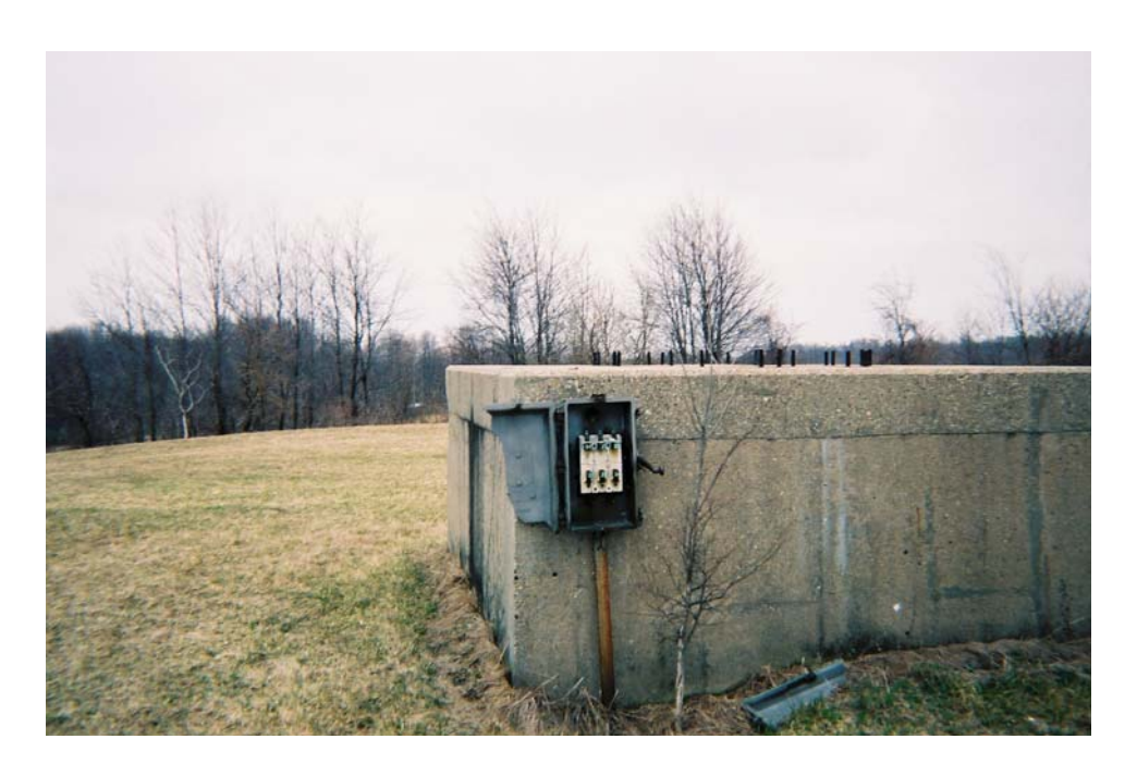
Close up of Radar Base with Abandoned Electrical Box