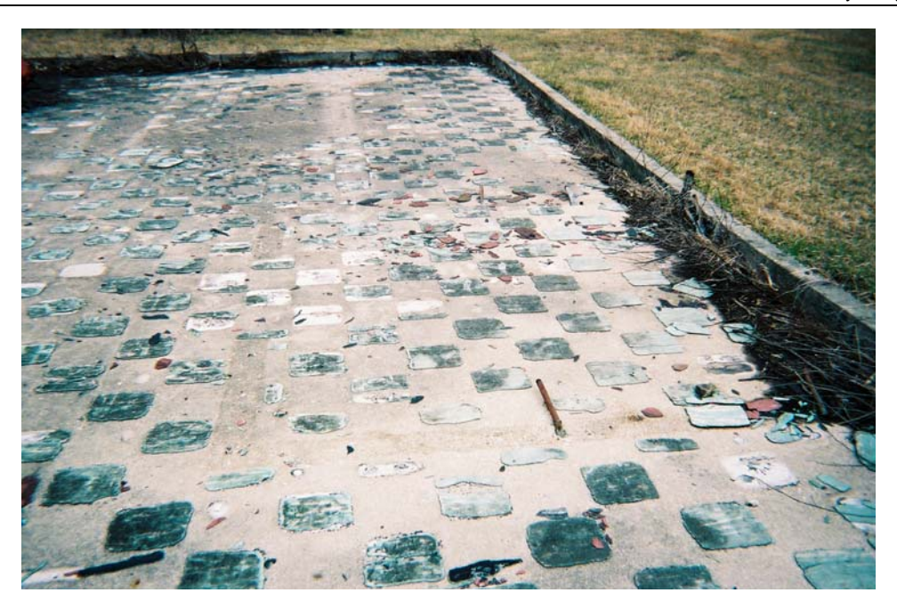
Close Up of Remains of Operations Building