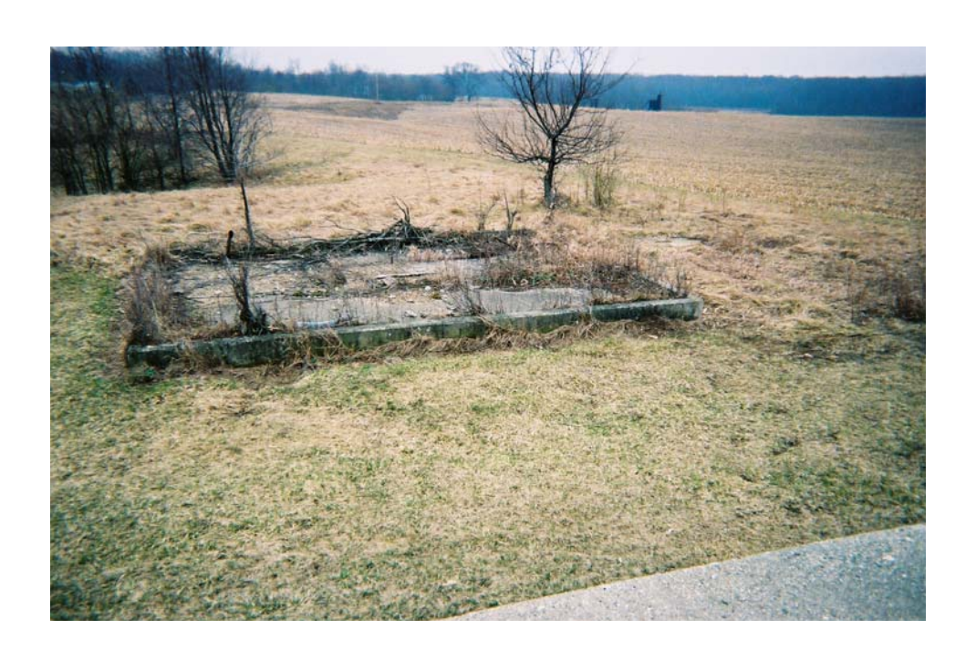
Remains of Maintenance/Generator Building