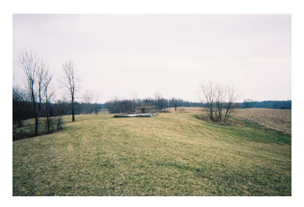
Looking at Remaining Foundations to East