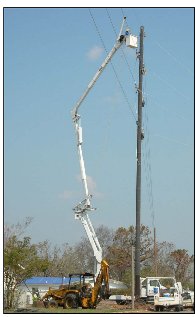
Tall order -- An electric power contractor elevates himself skyward to repair lines in a Keesler housing area Wednesday.